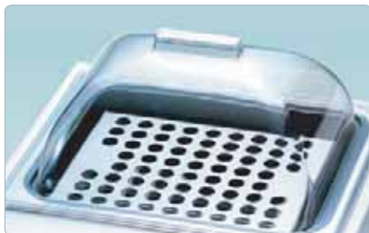
Transparent polypropylene gable covers