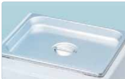
Stainless steel flat covers