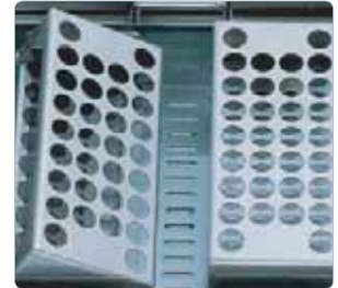
Test tube racks