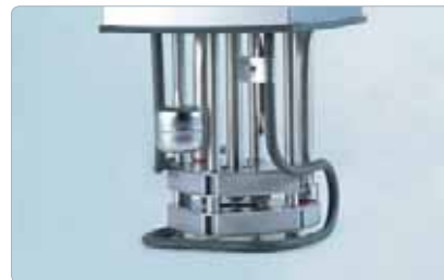
Suction function for pumps