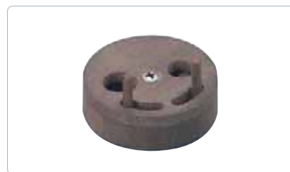
Viscometer tube holders