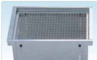
Spring wire racks